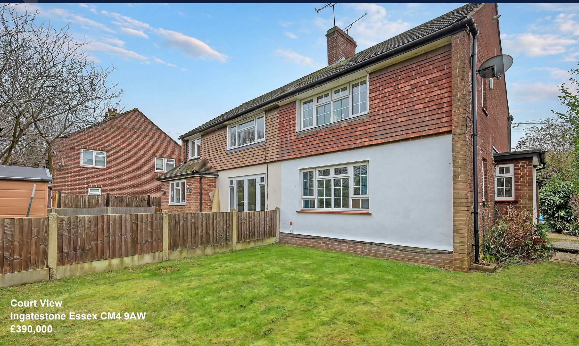
Court View Ingatestone Essex CM4 9AW £390,000